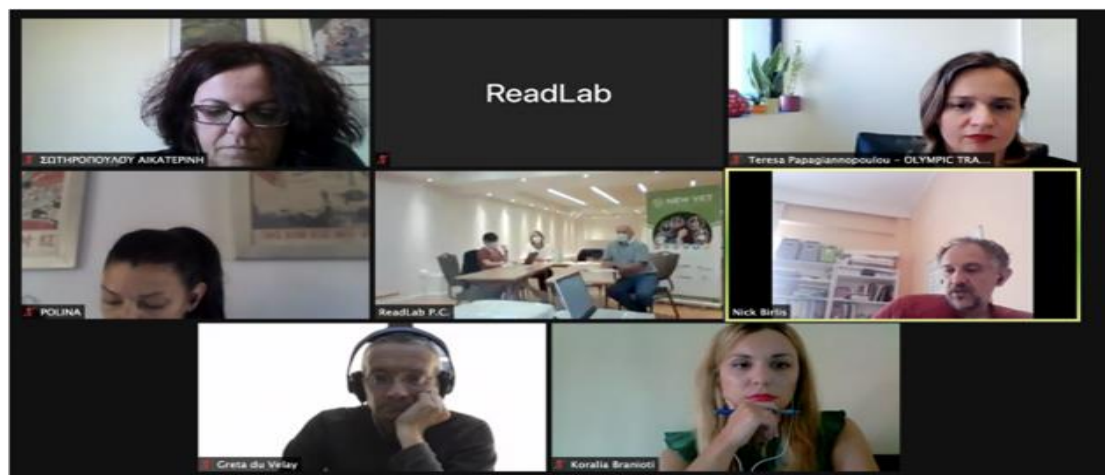
Image 1 Networking Cafe in Greece

During the networking café, the participants had the opportunity to present their organisations and share their experiences concerning work-based learning. Moreover, the legislation differences between companies, Vocational Education and Training and Higher Education institutes were analysed. Finally, the networking café event concluded with an overall discussion regarding the participants' views in conjunction with the NEW VET project's core objectives.